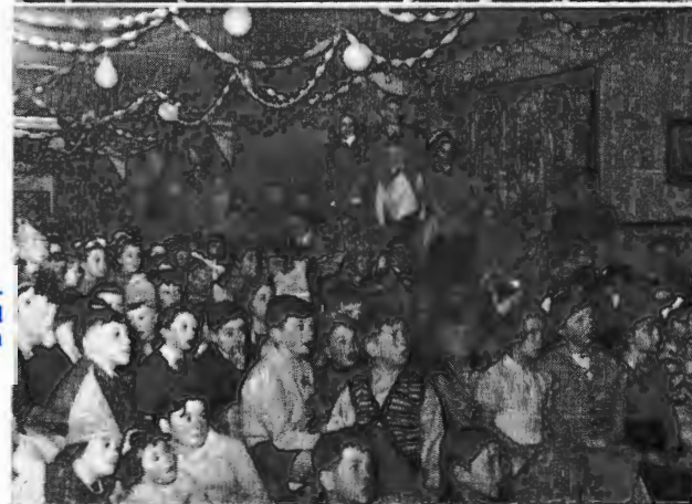
An attentive audience photographed during the film show.