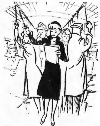
No. 22 "STANDING CHARGES"