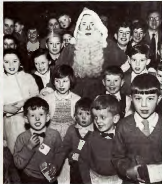
SANTA CLAUS AT LOVE LANE

The Staff Magazine of the Merseyside and North Wales Electricity Board