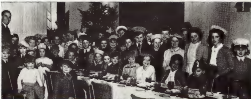
A happy group ready for the fray at the beginning of the Oswestry Children's Christmas Party.