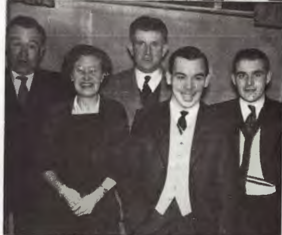
A group of Committee members responsible for the arrangements.