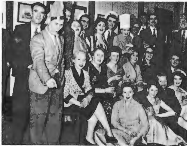
Members of the St. Helens staff in festive mood at the Rocklands Hotel.