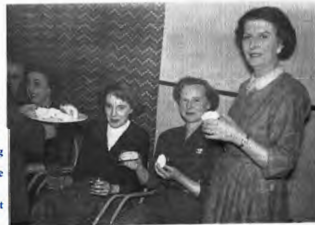
Ladies taking refreshment during a lull in the proceedings at the South District (Lister Drive) Yuletide party at Thingwall Road Sports Club.