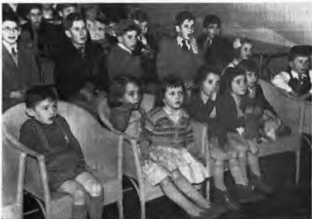
This photograph was taken during a film show at the Love Lane party.