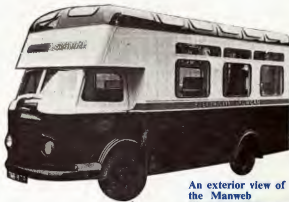
An exterior view of the Manweb Electricity Showcar.

Specially constructed vehicles which act as mobile Electricity Service Centres have been successfully employed in North Wales for some time. Recently a larger type of vehicle has been introduced for use in No. 1 Sub-Area, and these have already proved their worth.